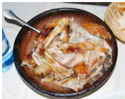
Roast Baby Lamb at Mannix, Campaspero

A starter of grilled chorizo or morcilla , a simple lettuce salad, a clay cazuela of lechazo and a local ewe's milk cheese for dessert makes for a truly memorable meal. Don't miss an opportunity to try this simple but immensely satisfying dish during your visit to the Ribera del Duero.