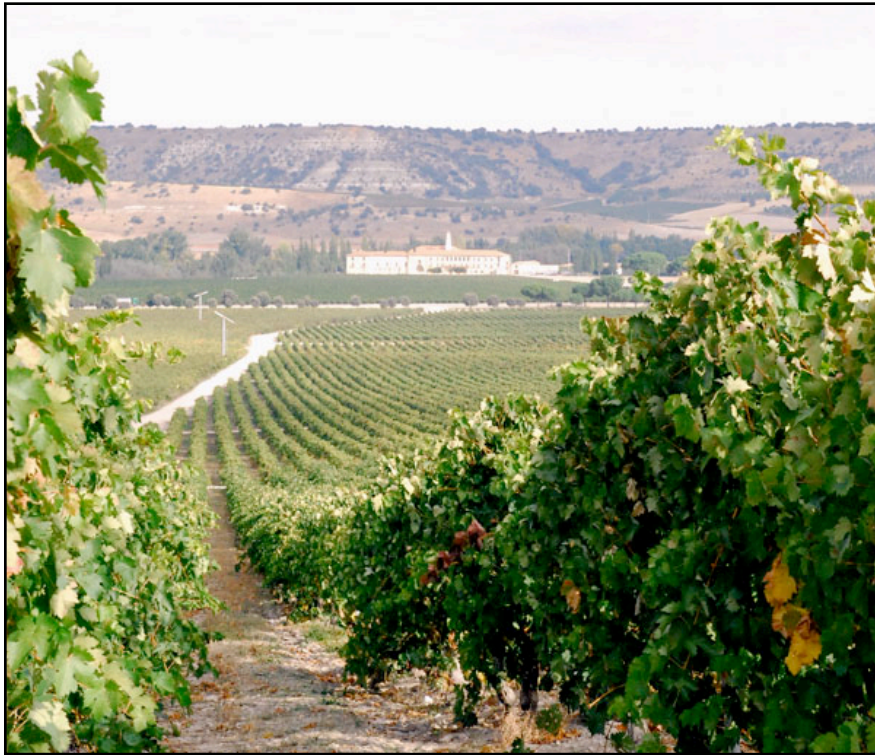
The Abadía Retuerta vineyards on the Milla de Oro, the "Golden Mile"

Savoring the Great Wines & Gastronomy of Spain