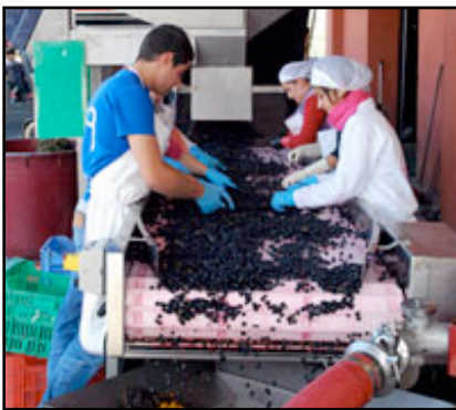
Hand sorting at Bodegas Comenge