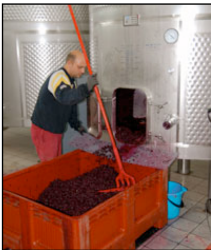
Removing grape skins at Bodegas Mauro

As of October 2010, the Ribera del Duero counted 255 commercial wineries with 35,000 hectares in production (about one third the area of their rival, Rioja to the north) scattered along its 115 km length. Major winemaking is centered in and around the towns of Peñafiel (Valladolid), Roa and Aranda de Duero (Burgos) and San Esteban de Gormaz (Soria), all of which sit along the banks of the Duero River.